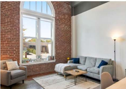
The Wonder Shops & Flats