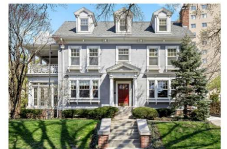
Southmoreland on the Plaza