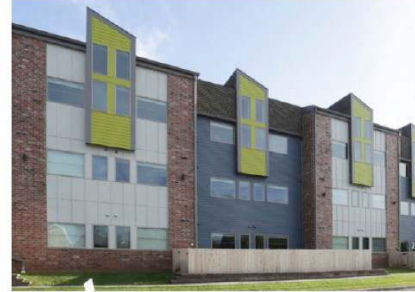
Pinnacle Lofts - Wichita